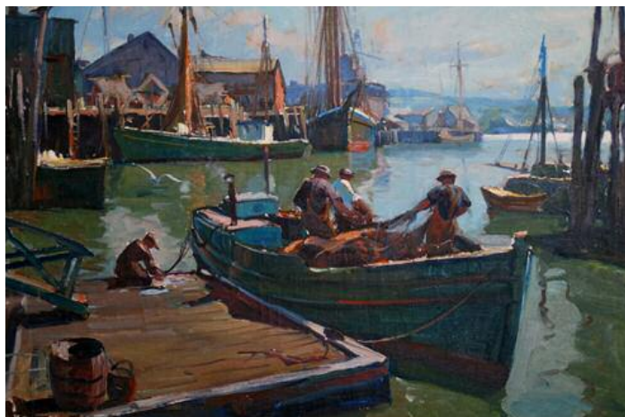
Above: Town Landing , 1948, by Emile A. Gruppé, oil on canvas, 29 x 38 in. Private collection.