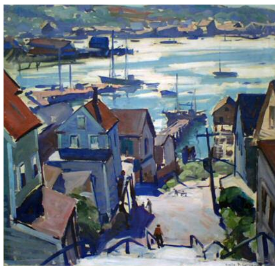
Above: Steps (Herrick Court) , c. 1930s, by Emile A. Gruppé, oil on canvas, 29 x 29 in. Private collection.